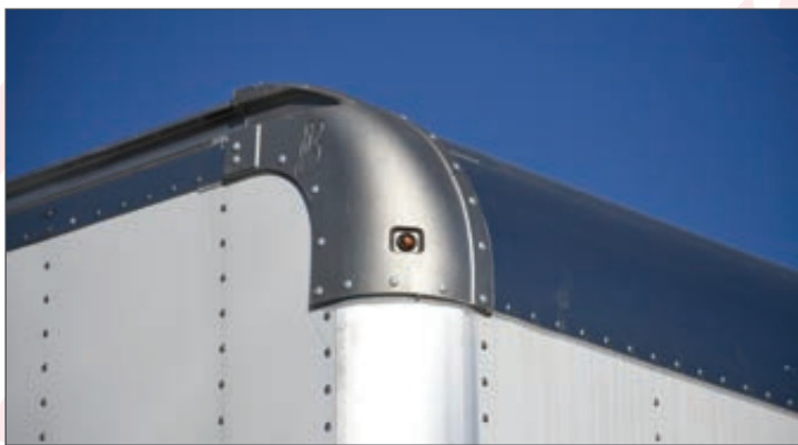
Unique aluminum corner cap design protects marker lights and ensures a strong impact resistant front end